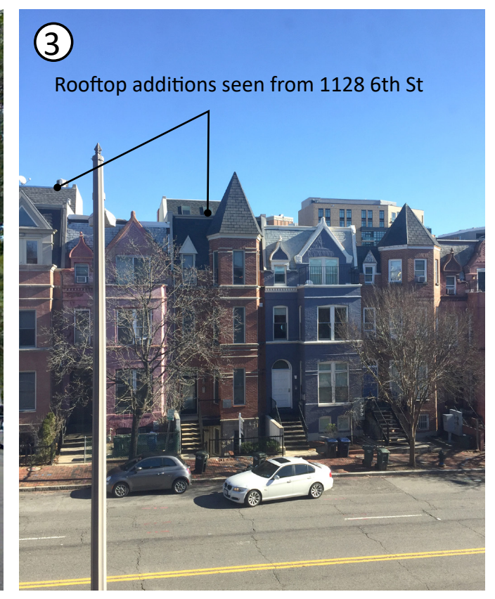
East View of 6th St Seen from 2nd Floor of Property

Board of Zoning Adjustment District of Columbia